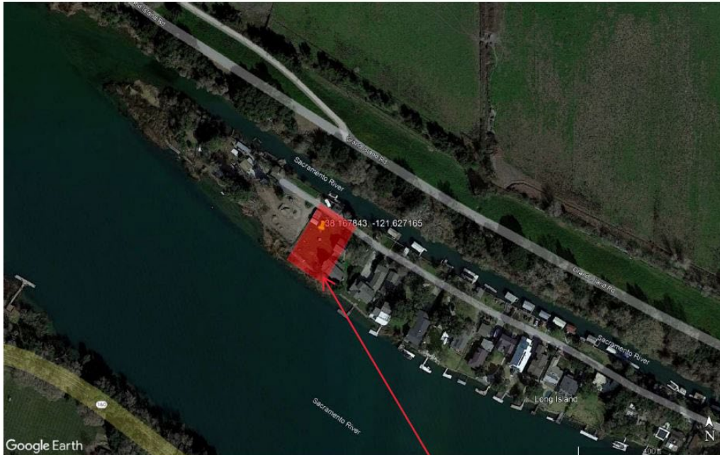
3) Approximate project footprint map